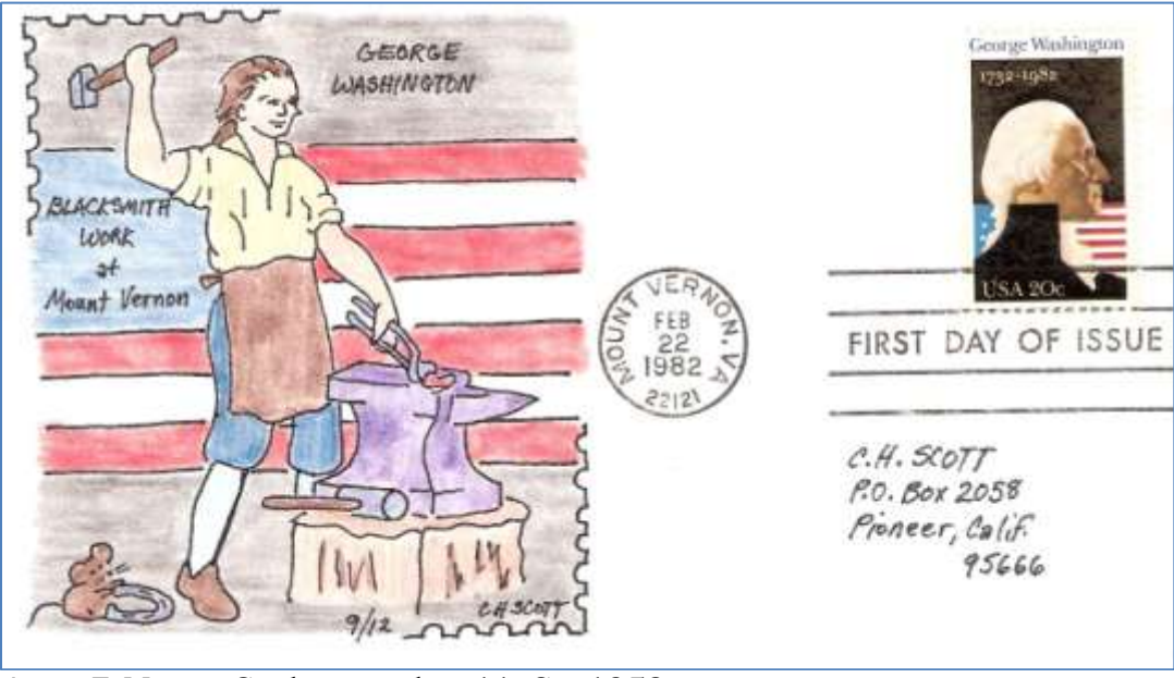
Anon E Mouse Cachet number 11, Sc. 1952

Looking back, I see that the flag in the background of these two cachets does not match the flag in the stamp; not enough stripes. There have been other "artistic license" errors or choices made over the years.