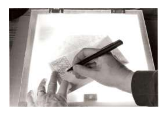
The first cachet made on this light box sold out quickly:

Most of the time January 1982 through August 1987, I continued to draw each original cachet design by hand on a 3-1/4" square piece of paper and slip it into a regular #6 envelope, for tracing over.