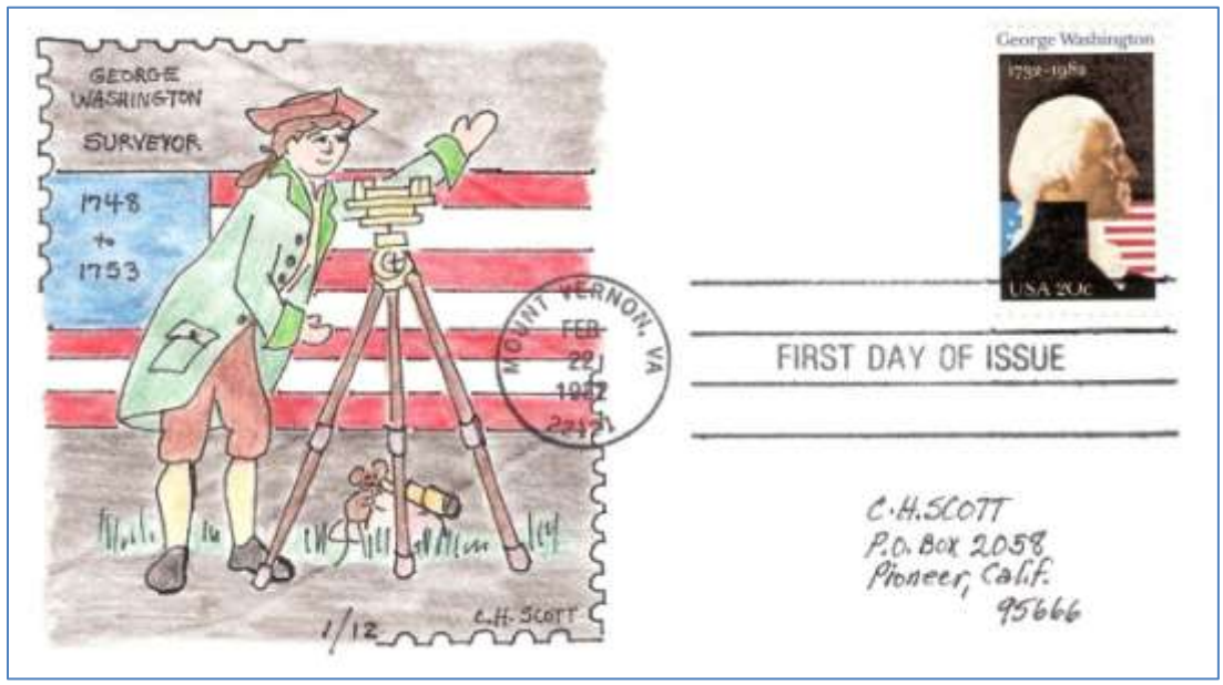
Anon E Mouse Cachet number 12, Sc. 1952

Here is George doing survey work. I was fascinated by his early labors and life before becoming a military leader in the Revolutionary War.