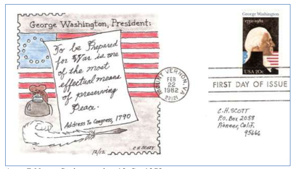
Anon E Mouse Cachet number 13, Sc. 1952

In this Presidential cachet, I finally worked in the 13 flag stripes representing the original colonies forming the young United States of America.